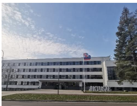
Main entrance to the Faculty of Civil Engineering and Architecture, KTU

Please enter the building through the main entrance and go to the second floor. You will see the signs to the meeting premises.