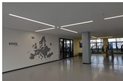
Entrance to the meeting premises (M6, M7, M8, M9)