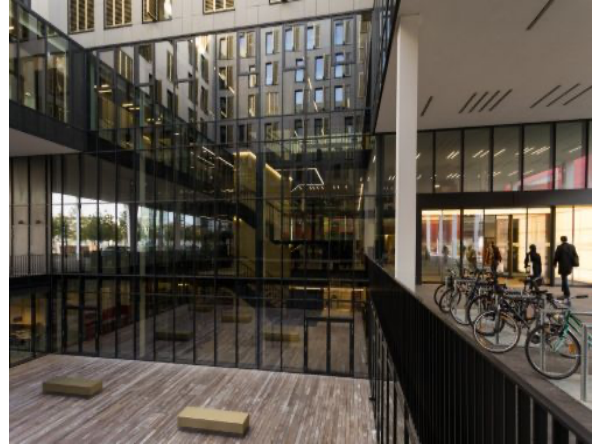
Masoin des Sciences Humaines