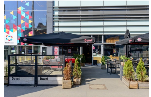
Entrance to Snooze Pub, Belval

Snooze Pub serves all kinds of burgers and salads. More information can be found at http://city.snooze.pub/brunch-in-belval . It is only 550 m or 7 minutes to walk from the venue, please see the map.