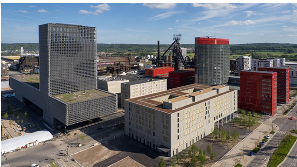
Belval Campus of University of Luxembourg